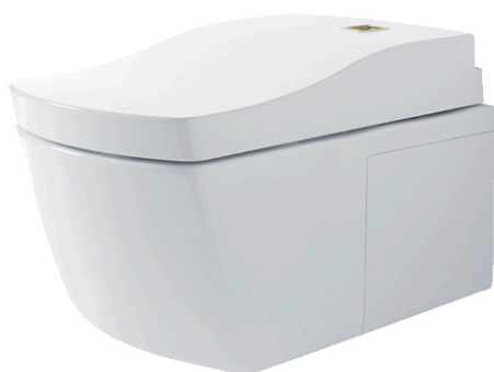
Neorest LE II carrying Innovative Actilight Technology